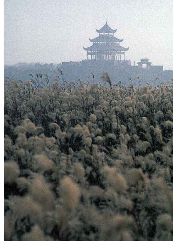
Reeds, like these in Poyang Lake Ramsar Site, China, remove pollutants from the water.

Of course nature has its limitations, and it would be wrong to consider that wetlands can deal with whatever types and quantities of waste we humans can produce. This was vividly demonstrated by two environmental disasters in Europe, in which storage reservoirs holding toxic wastewater from mining failed. In southern Spain, in 1998, more than 5 million cubic metres of sludge laden with heavy metals poured into the Guadiamar River, threatening the world-famous Doñana wetlands (a Ramsar Site). Over 4,500 hectares were affected and the clean-up bill for the regional government reached EUR165 million. Less than two years later, in Romania, 100,000 cubic metres of wastewater containing cyanide and heavy metals flowed into a tributary of the Danube River, contaminating 1,000 kilometres of river ecosystems in Romania, Hungary, Serbia and Bulgaria.